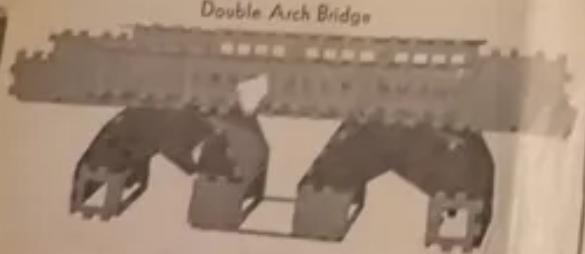
Double Arch Bridge