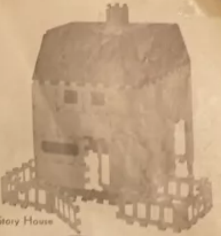
Two Story House